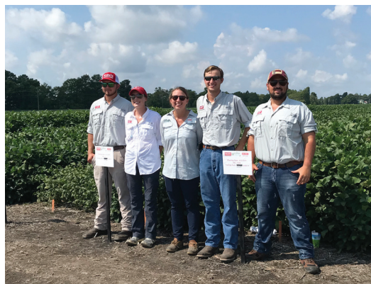
NC State Soybean Extension Team

As the farming landscape in N.C. continues to change, one of the goals of the Association is to fund projects which help members transition soybeans from a purely rotational crop to a profit opportunity. N.C. State has been a great partner in helping carry out this research over the last 50+ years and new faculty faces in the College of Ag and Life Sciences are bringing energy and new ideas to the soybean agronomic research pipeline.